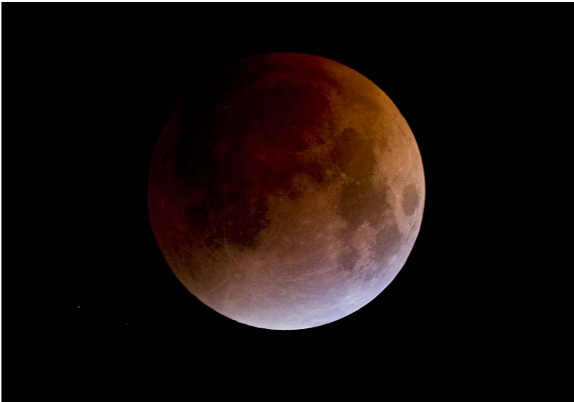
August 28 2007 Celestron 102F